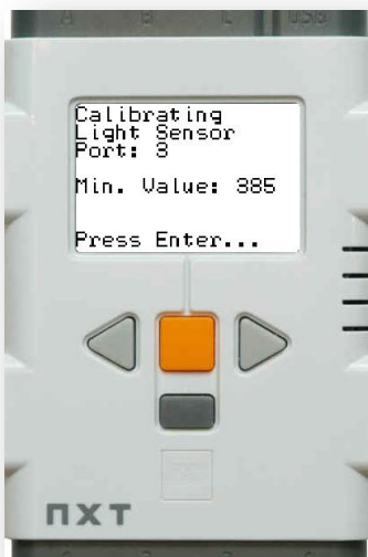
Figure 3: Position over black and press enter